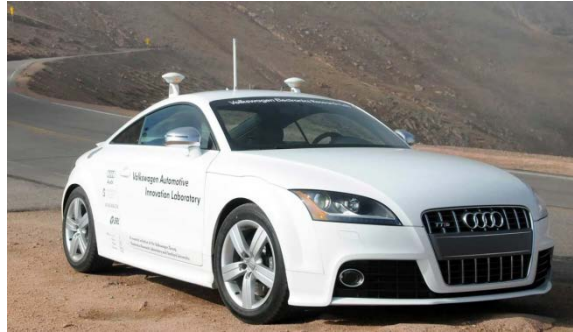
3: Audi Autonomous TTS 7

Test vehicles operated by Google and others are claimed to operate with full autonomy already. Provided that supportive law develops, various manufacturers predict the following features will be available on production models.