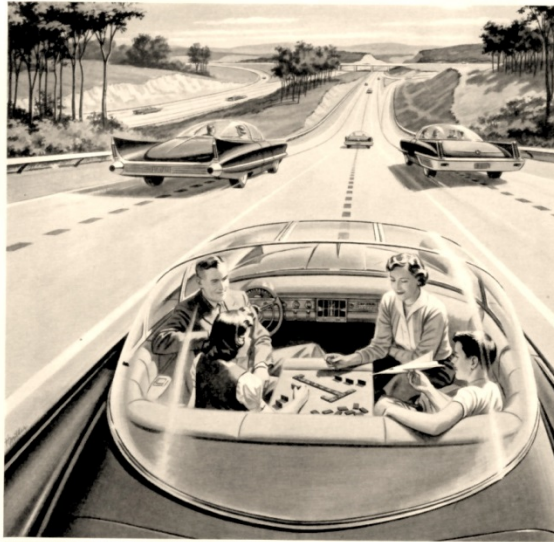
ELECTRICITY MAY BE THE DRIVER. One day your car may speed along an electric super-highway, its speed and steering automatically controlled by electronic devices embedded in the road. Highways will be made safe—by electricity! No traffic jams... no collisions... no driver fatigue.

Driverless Cars were suggested in the 1940's. The original idea relied on a centralized grid, which would direct your car while you enjoyed the ride.